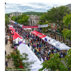
Main Street Melrose, MA 02176 United States

It was such a blast hosting a Bread of Life booth at the Melrose Chamber of Commerce Victorian Fair! It was a great day!